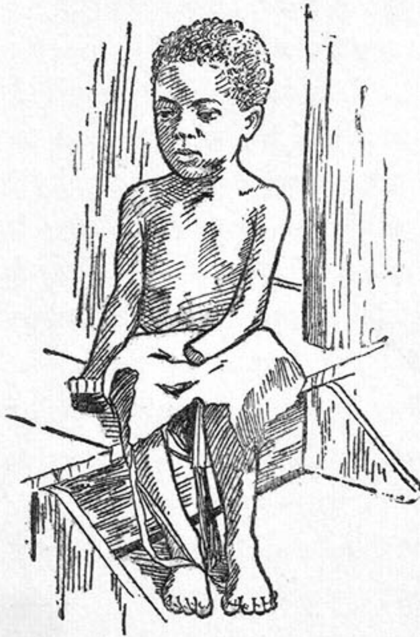
FROM PHOTOGRAPH, IKOKO, CONGO STATE

Why, certainly— that is my protection. And you will continue to do it. I know the human race.